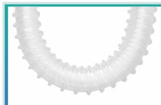
加强管 / Strengthen tube

Double vertical interface, keep the water cup in a vertical position at any time, maximize the function of using water cup, reduce water accumulation in the tube.