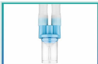
积水杯 / Water cup

Equipped with the detection port of temperature and pressure, easy to takesample and test at the same time