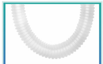
波纹管 / Corrugated tube

The hardness is high, good anti-distortion not easy to bend, the inner wall is smooth without hydrops.