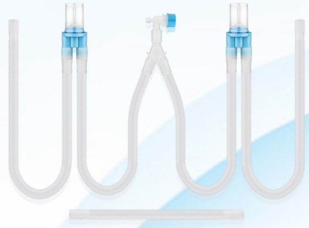
一次性使用呼吸回路（波纹管） Corrugated type